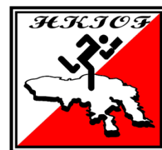
Hong Kong Island Orienteering Force 港島定向力量