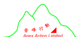
Apex Action Limited 晉峰行動