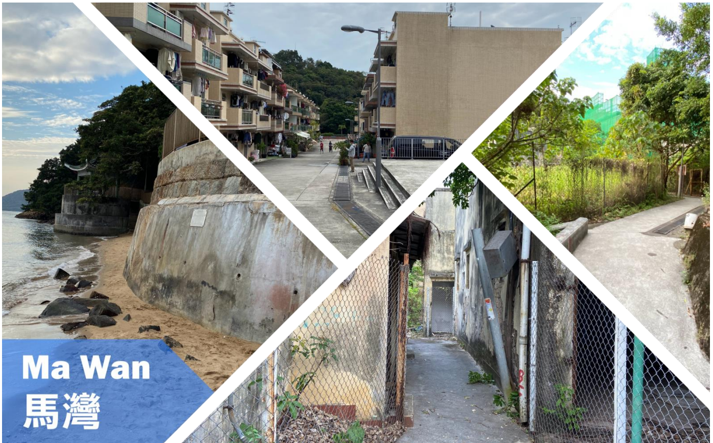
Ma Wan 馬灣

“Maybe this is one of the super tiny islands for orienteering ever in the world. Ma Wan is one of the islands in the North-East part of Lantau Island, surrounded by four busy marine channels. There is no other venue where you compete in terrain ranging from old fishing villages, estates with modern parks, and beaches in one sitting, with the rails and cars shuttling on the 13 th longest spanning suspension bridge - Tsing Ma Bridge. The mix of old fisherman village and model village estates on the island is also an attraction for both locals and visitors. With the opportunity to have orienteering here, you can see a lot more than being a normal tourist!”