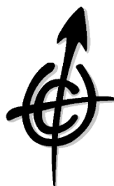
Queen's College Orienteering Club 皇仁書院野外定向會